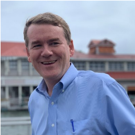
Michael Bennet for U.S. Senate